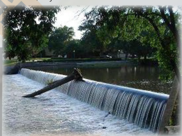
The Alden Dam on the Iowa River, in Alden, IA where two canoeists died on April 29, 2007.

Tragedies like this can be avoided if certain precautions are taken. The canoeists did the right thing by exiting the river upstream of the dam and portaging around it. However, they re-entered the river too close to the dam.